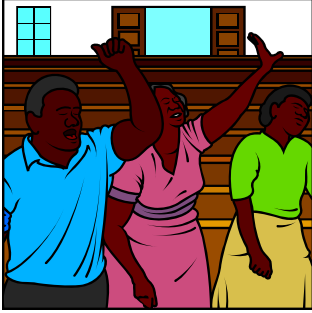
Prayer and Praise!